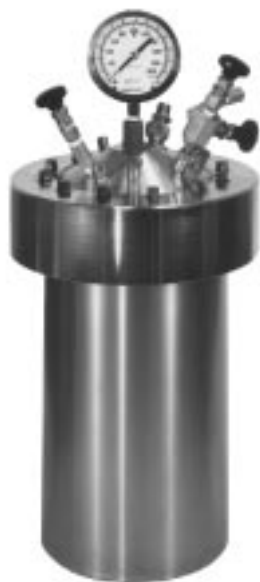
Model 4677, 18.5 L Vessel, with Valves, Gage, and Thermowell