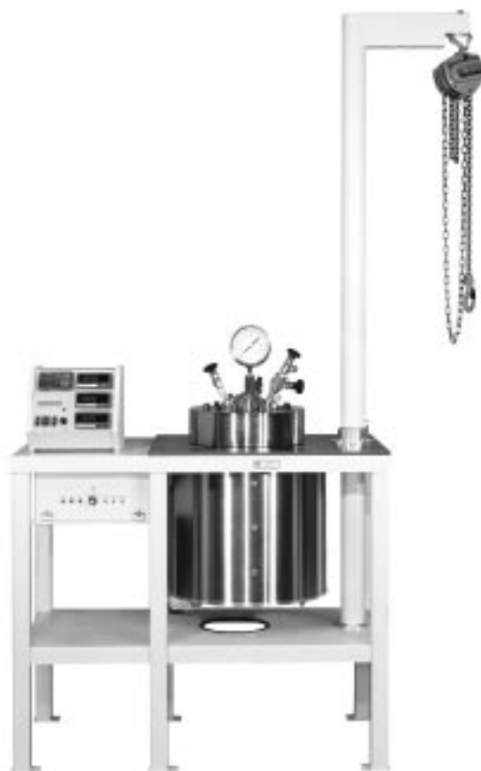
Model 4677, 18.5 Liter Vessel with Heater, and 4842 Temperature Controller