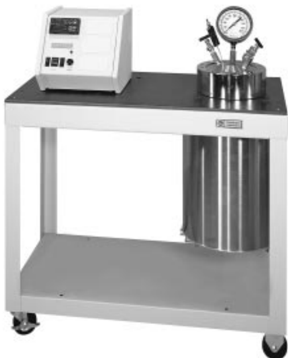
Model 4674, 5800 mL Vessel, in 4934 Heater with 4842 Temperature Controller