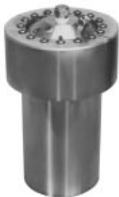
Model 4672, 3750 mL Vessel