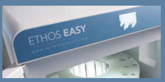
ULTIMATE EASE OF USE AND CONTROL