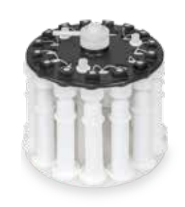
MMR-15 Evaporation/ Concentration rotor