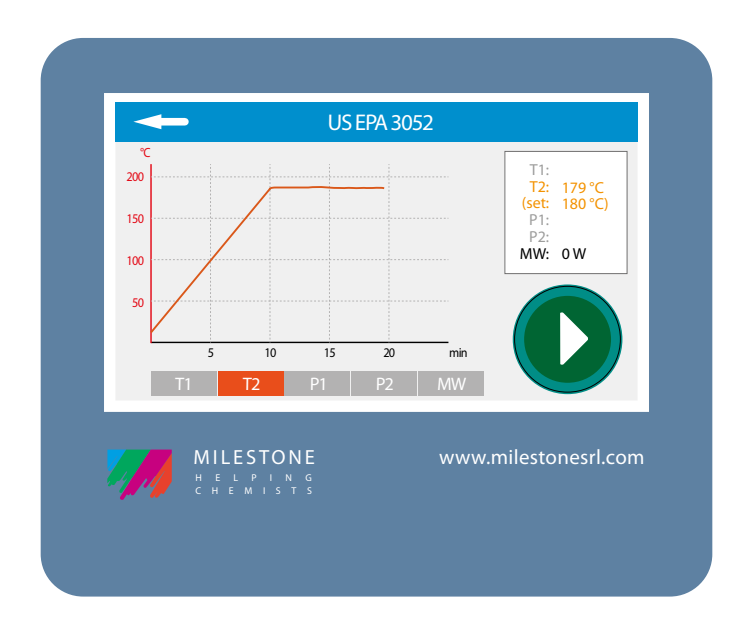
Temperature profile of a soil digestion in accordance with US EPA 3051 using the MAXI-44 rotor

The easyTEMP contactless sensor directly controls the temperature of all samples and solutions, providing accurate temperature feedback to ensure complete digestion in all vessels with superior safety. This technology combines the fast and accurate reading of an in-situ temperature sensor with the flexibility of an infrared sensor. The temperature profile of the digestion process is displayed in real-time on the ETHOS EASY terminal.