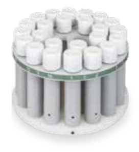
fastEX-24 Extraction rotor for environmental sample