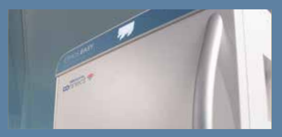
SUPERIOR SAFETY AND RELIABILITY