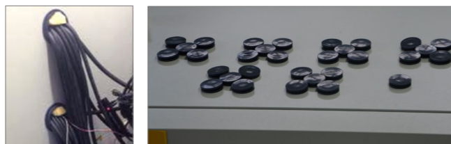
Access ports for cables and power cables.

Precise positioning in almost all sizes and locations is possible in consultation with our BINDER INDIVIDUAL department. Access ports available in silicone or stainless steel.