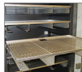
Telescopic rails for easier loading of the chamber