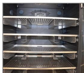
Additional access ports available in almost all sizes and locations