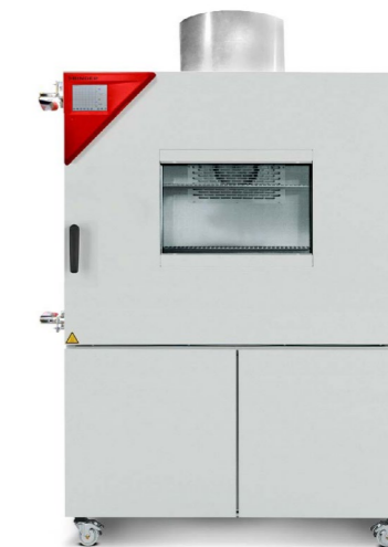
Model MK 240 with package P

In the manufacturing process of the lithium-ion cell, components are dried. Our vacuum drying ovens series VD and series VDL as well as our drying oven Series FED are suitable for this.