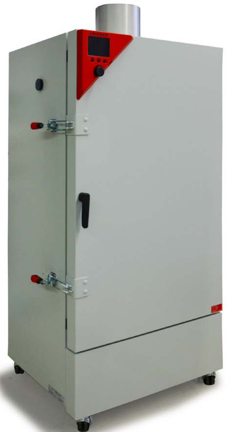
Model KB 400 with package P