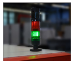
Program sequence display using indicator lamps