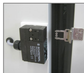
Electromechanical door lock mechanism controlled in a program and/or manually